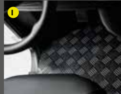
Rubber front carpets