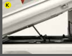
Hydraulics for tipping body