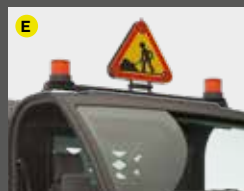
Full kit roof LED lights + AK5