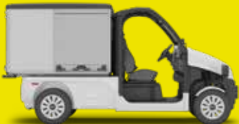
PULSE 4 - LONG