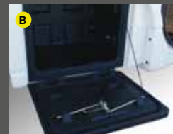
Side storage boxes