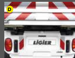
Class 2 reflective strips