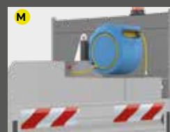
Sprinkling and spraying