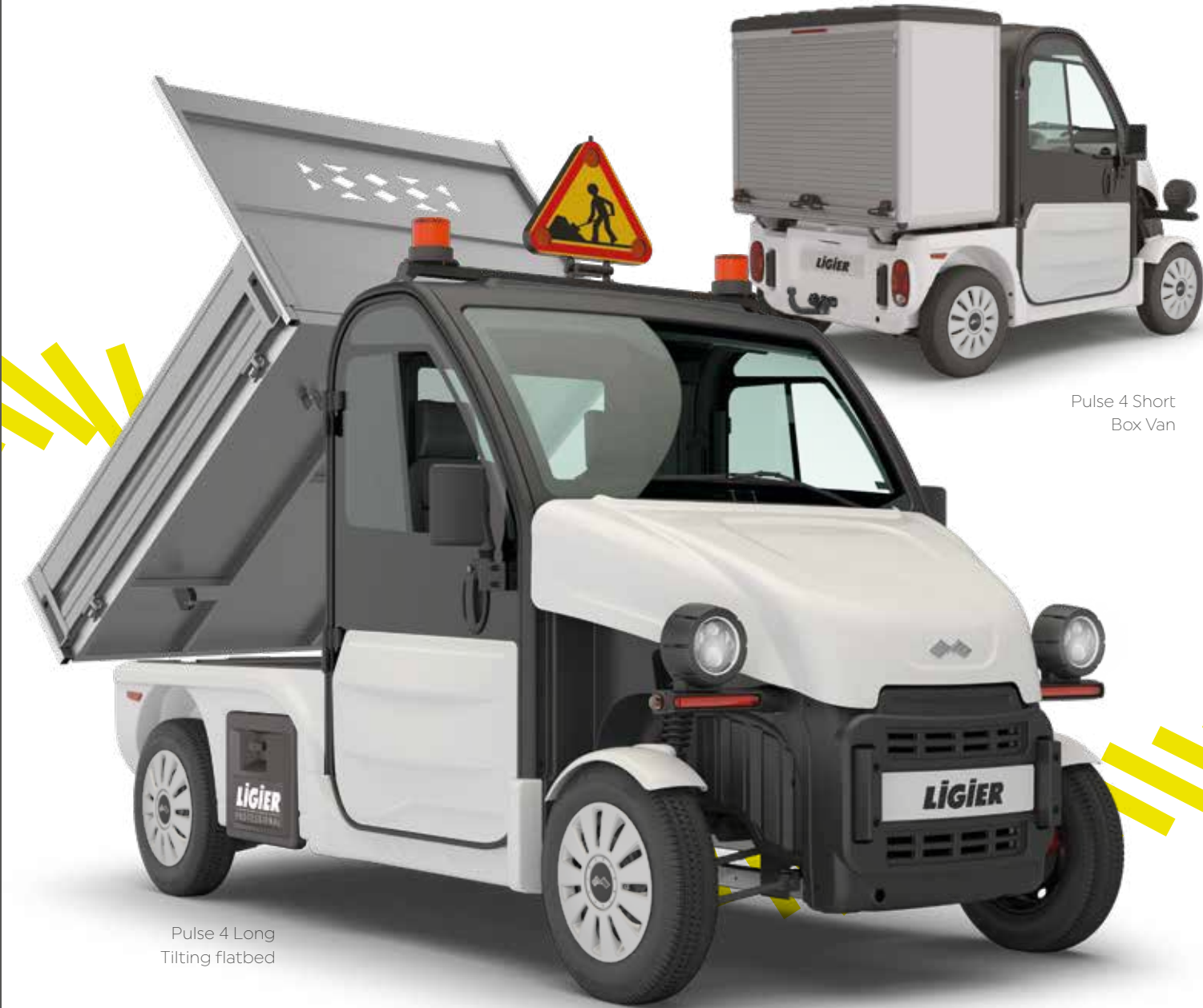
Pulse 4 Long Tilting flatbed