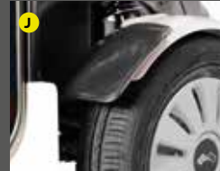
Front rubber mudflaps