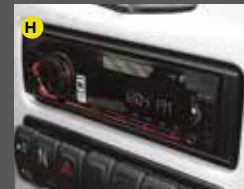
Bluetooth car radio