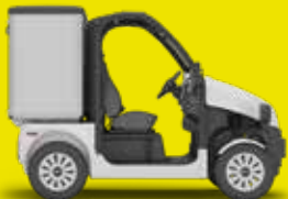
PULSE 4 - SHORT